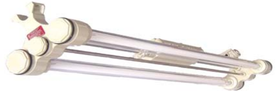
TYPE FNR 240