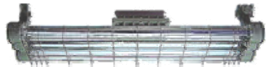
TYPE FNR 240 G with Guard